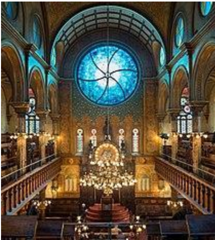
Eldridge Street Synagogue NY City

A Jewish place of worship goes by several names: shul, beit, congregation and Temple. Synagogue is the most general term and the most recognized. The most significant item in a synagogue is the ark, a cabinet or container that holds the Torah scroll. The ark symbolizes the Holy of Holies, and it is the most sacred place in a synagogue and the prime focus of prayer. During particular prayers, the ark's doors or curtain can remain open or closed.