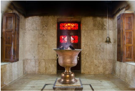
Photo 2 Varahram Fire Temple, Yazd, Iran