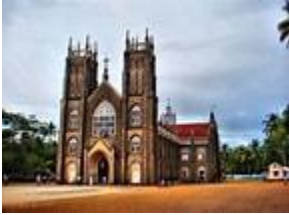
St Andrews Basilica, India

as the Eucharist or Holy Communion. The pulpit is where the minister gives his/her sermon, and s/he uses the lectern to read the Bible out loud during services.