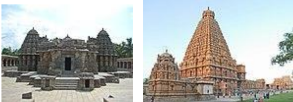
Hindu temples in India

other gifts are frequently provided. Small shrines to Hindu gods and goddesses can be found on roadsides and on streets. They can stay there permanently and untended or be put on a cart and moved around.