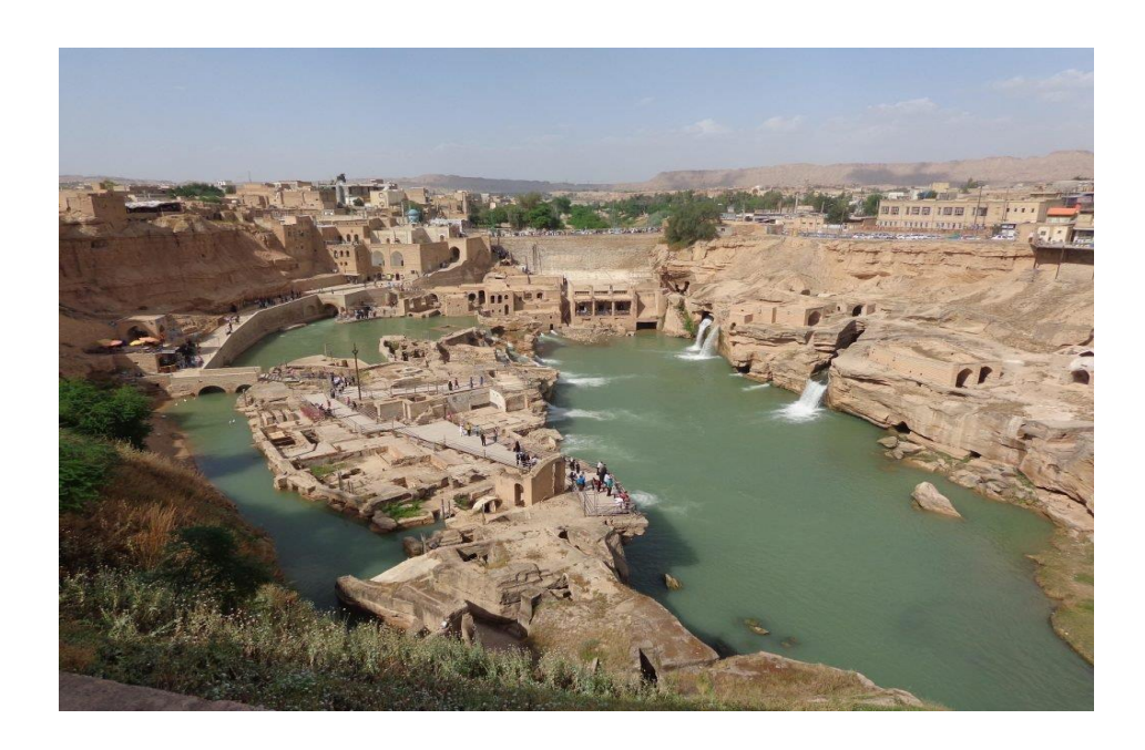
Photo 2: The earliest irrigation technology in Khuzestan 6000 B.C.E.