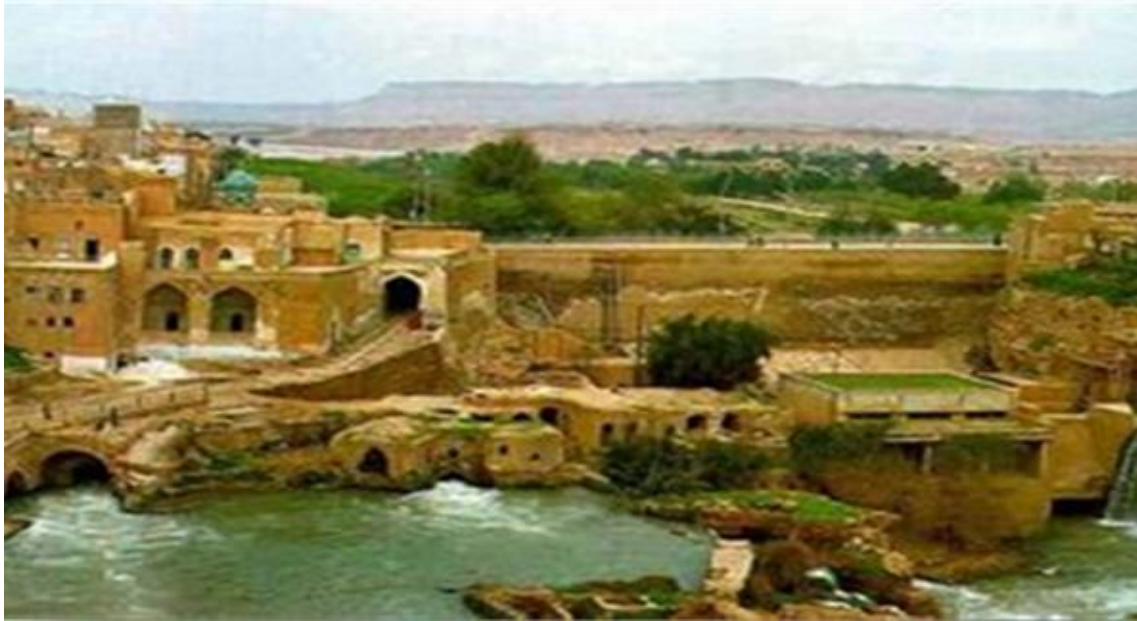
City of Susa in Iran, Province of Khuzestan