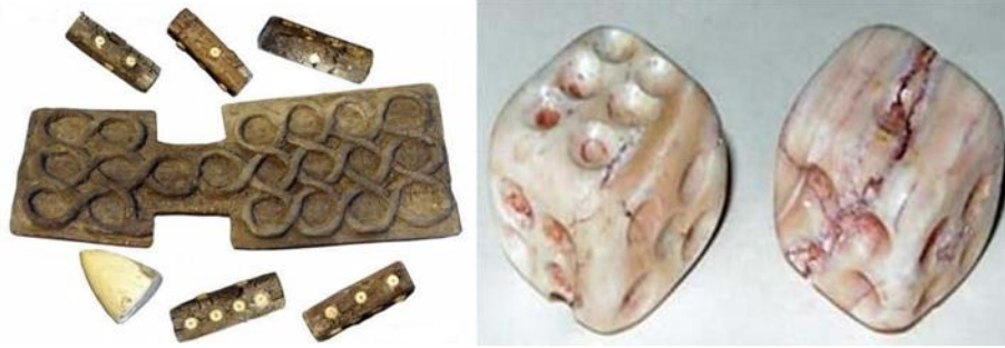
Backgammon board with pieces and two dice