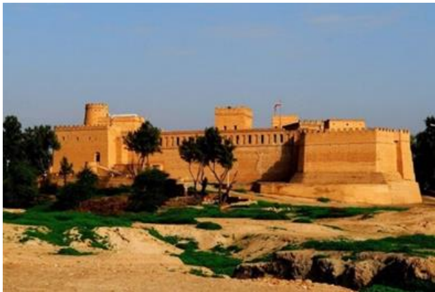
Susa, Iran (UNESCO)