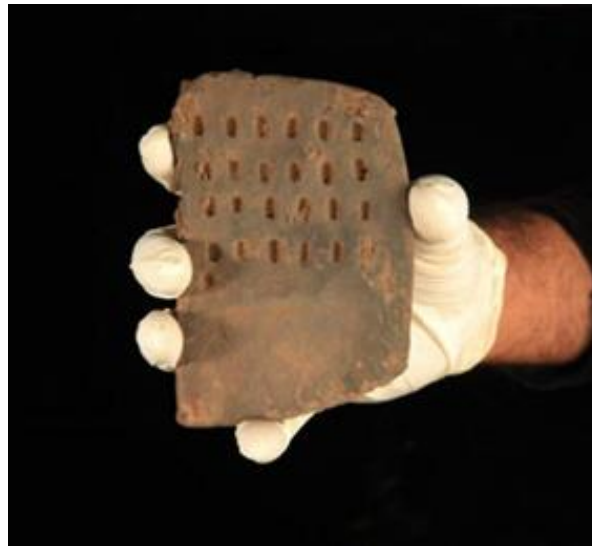
Elamite counting tablet found in Burnt City, Iran