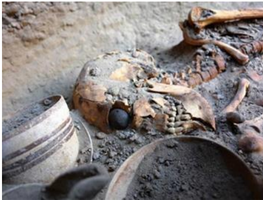
Artificial eye found at Burnt City