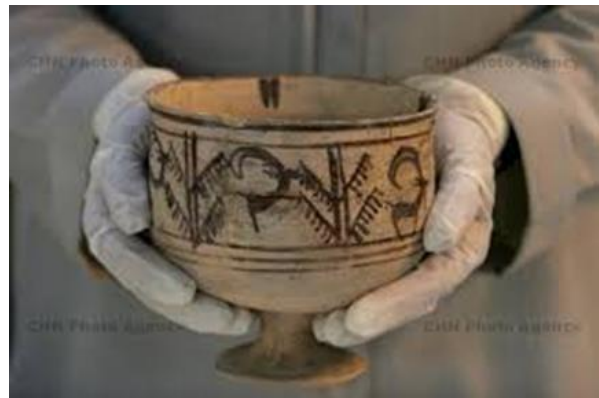
Oldest animation discovered at Burnt City (Turn the vessel fast and the animal will seem to jump up and down)