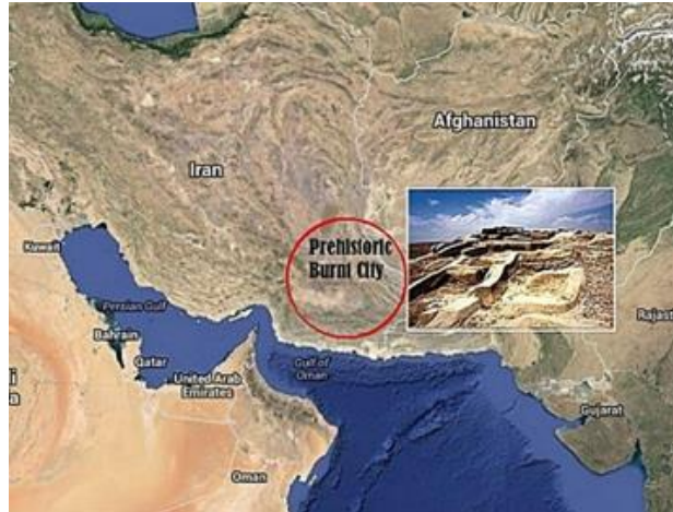
Location of Burnt City