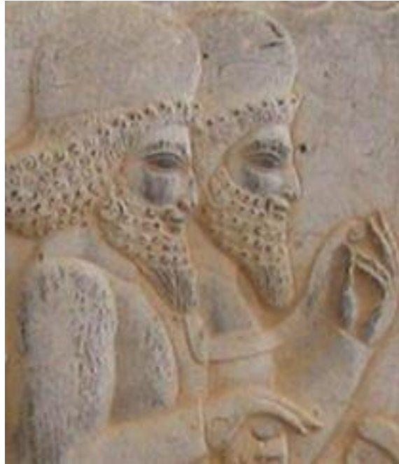
Medes with earrings and round hats, Central Palace, Persepolis, Iran