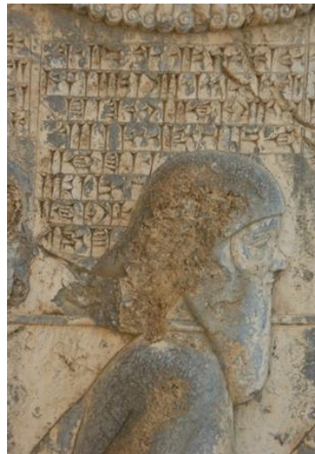
The standing Mede: Medes at eastern stairs of the Apadana, Persepolis, Iran The head image: The Median king “Phraortes” on the Behistun relief