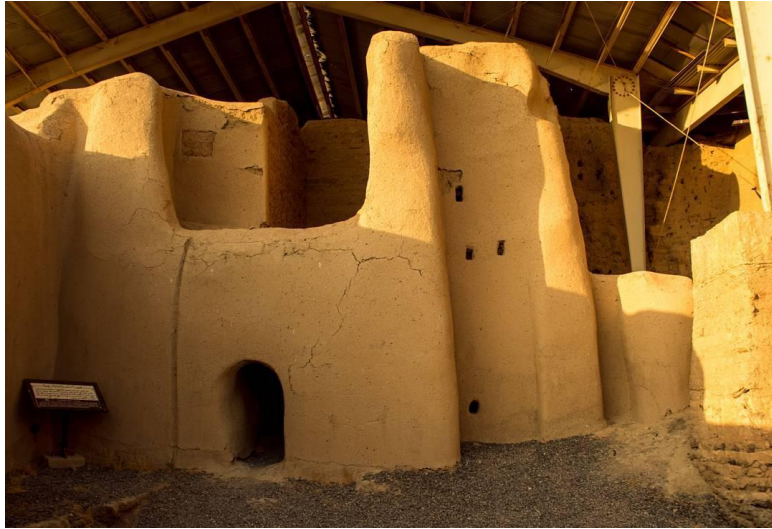
Nooshijan Tappeh: ancient site with fire altars in it