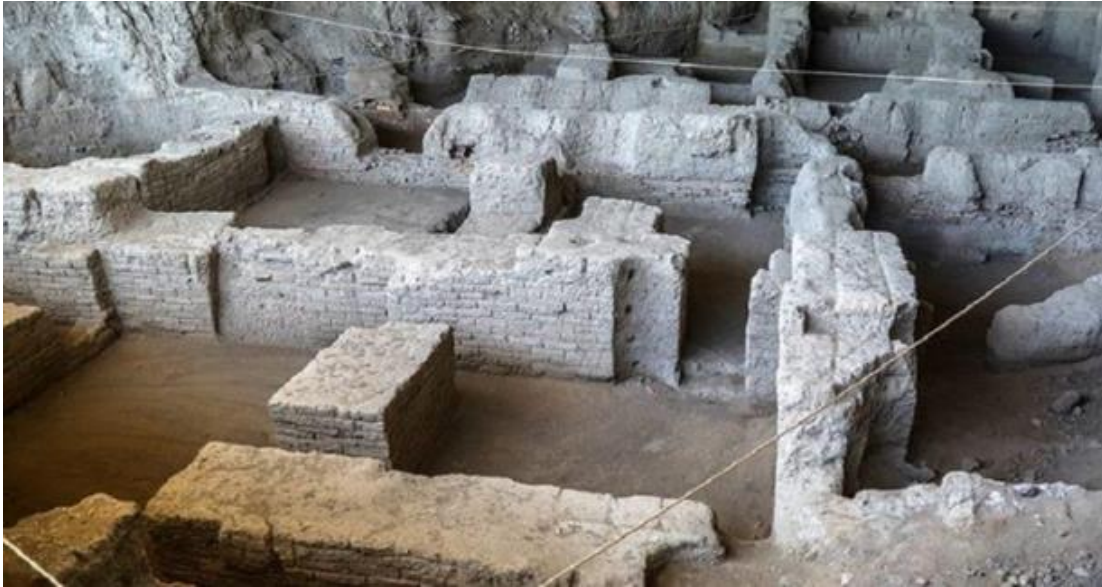
Remains of Ecbatana in Hamedan, Iran