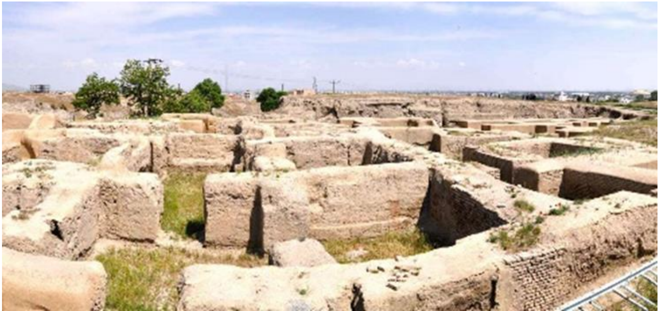
Hagmatana Hill (Tappe-ye Hagmatana), an archaeological mound in Hamedan.