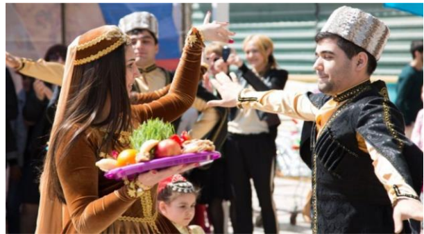
Iranian Azeris celebrating Norouz