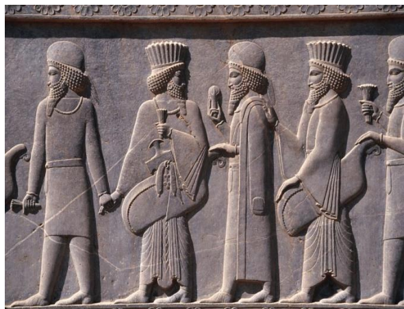
Medes and Persians – Apadana Palace, Persepolis – Iran