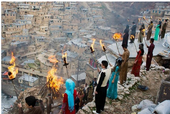
Iranian Kurds celebrating Nowruz.