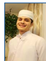
North American Mobeds Council Community Services Award