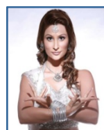
Dinshaw Framroze Joshi Excellence in Performing Arts, Painting or Literature Award