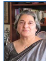
Humanitarian Service Award