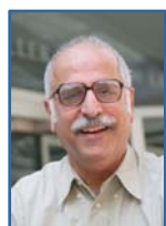
Jamshed and Shirin Guzdar Excellence in Business or Profession Award