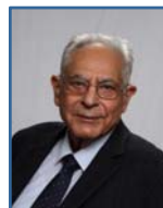
Rohinton Rivetna Outstanding Zarathushti Award