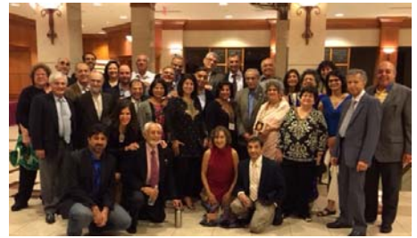
Delegates representing fifteen FEZANA Member Associations attended the FEZANA AGM