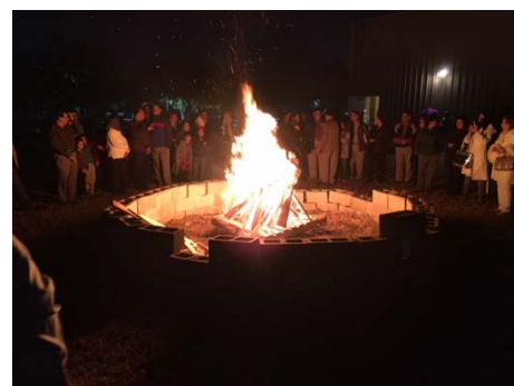
Zoroastrian Association of Houston, Houston TX