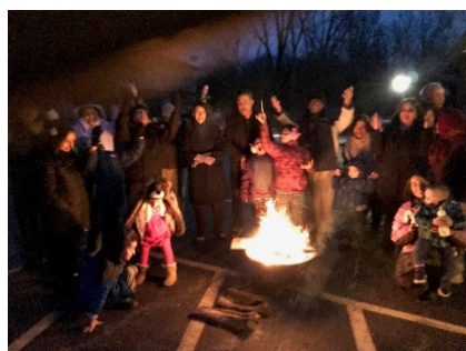
Zoroastrian Association of Chicago, Burr Ridge, IL