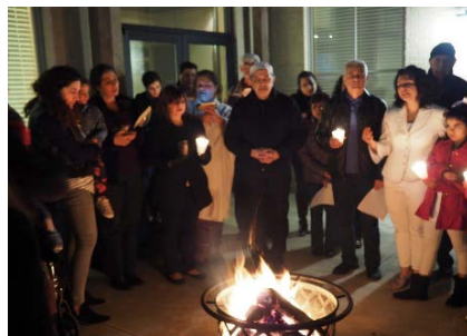
Zoroastrian Association of North Texas, Flower Mound TX

In January, many FEZANA Member Associations and small groups celebrated Jashn e Sadeh in various ways. This ancient celebration is part of our shared heritage and provides a wonderful occasion to anticipate the coming of Spring and the celebration of Nowruz !