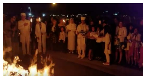
California Zoroastrian Center, Westminster, CA