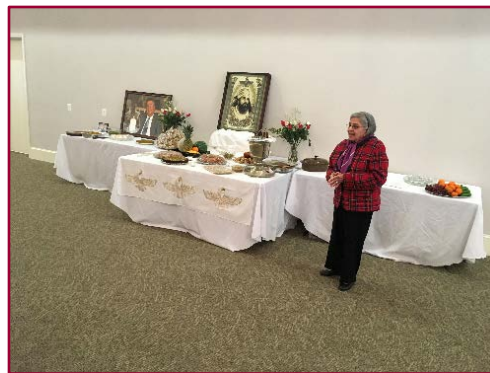
Zoroastrian Association of Metropolitan Washington D.C. [ZAMWI].

On March 17, 2018 many FEZANA Member Associations and small groups celebrated Hamaspathmaidem Gahambar , (the last of the six Gahambars in a year) and the Panjeh Meh prayers prior to Jamshedi Nowruz. We salute those communities who are reviving this tradition.