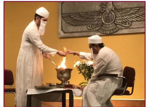
Zoroastrian Association of Chicago, [ZAC-CHI] Burr Ridge, Illinois

Hosted by WZCC-Chicago and ZAC-CHI, the Second Annual Hamaspathmaidem Gahambar celebration and Panjeh Mah prayers with audience participation was well received.