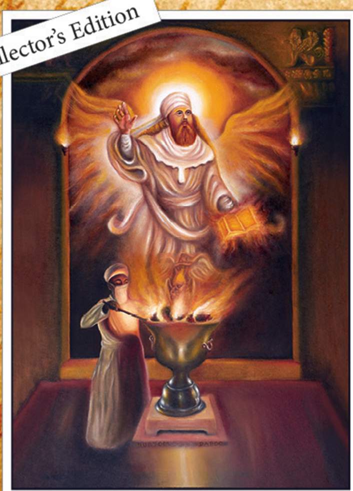
Reprints Size : 19 inches X 26 inches Set : Each set will have 6 different paintings

Ahunavaiti 1.1 (Ha 28.1) ahyâ yâsâ nemangi ustânazastô ra manyêush mazdâ p ashâ vîspêñg s vanghêush xratûm