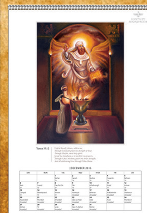
Calendar Small Size : 13 inches X 19 inches Pages : 12 pages - (6 different paintings)