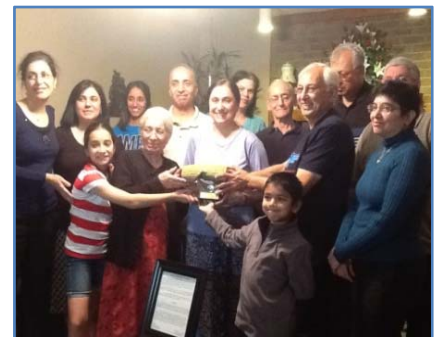
A replica of the Cylinder of Cyrus presented to representatives of ZAKOI